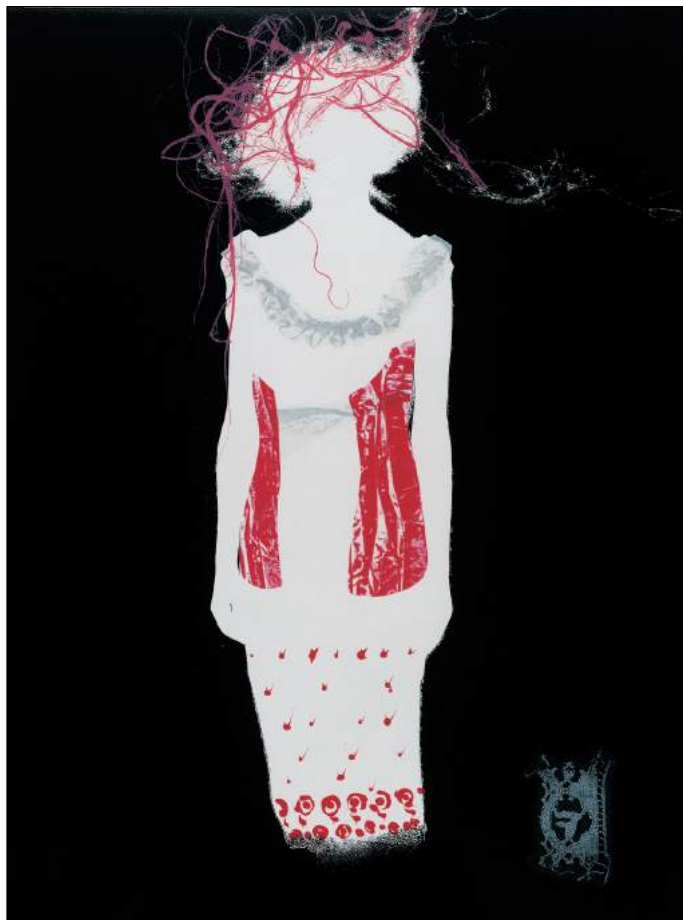
DECOUPAGE III COMME DES GARÇONS VOGUE, JAPAN, 2001