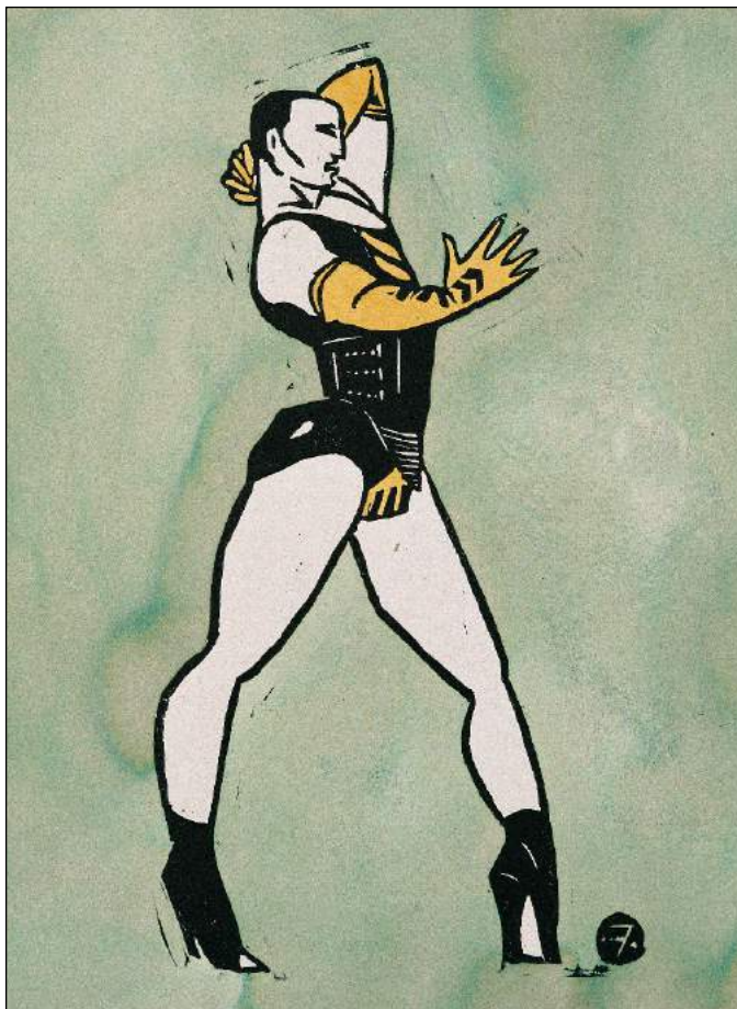
HERALDIC MAN JEAN-PAUL GAULTIER VANITY, ITALY, 1986